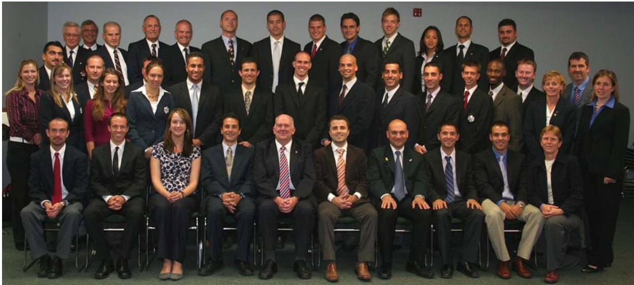
Picture of referees that participated in U18 National Club Championships