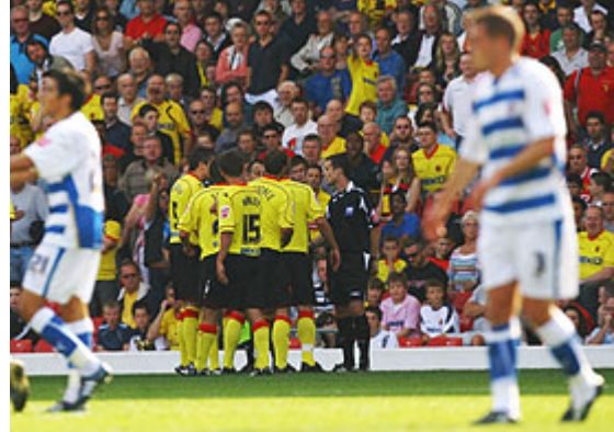
Watford players debate the 'ghost goal' with the officials at Vicarage Road.